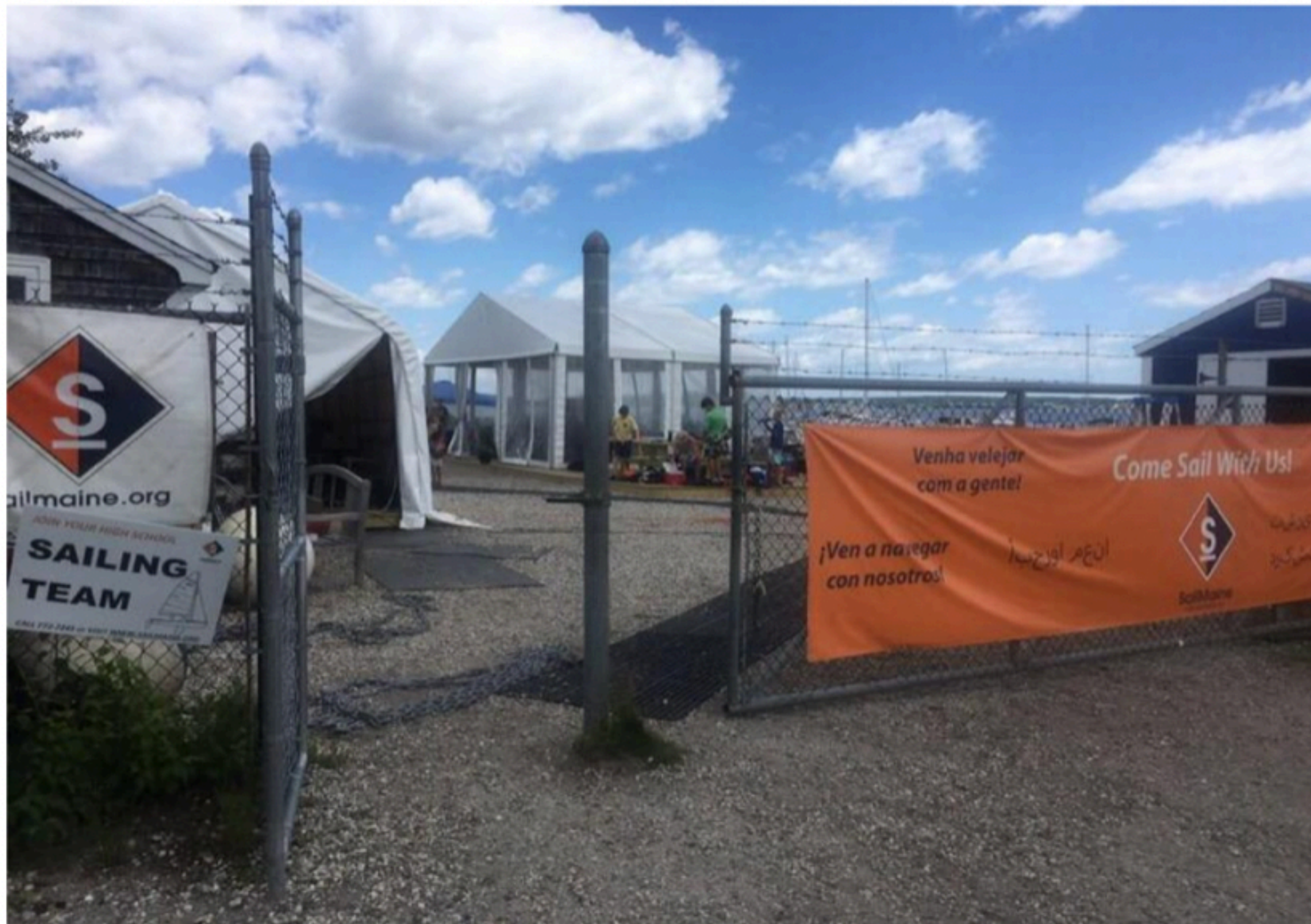
This is the main entrance.