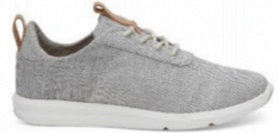
Closed toe shoes

...because the weather can be unpredictable.