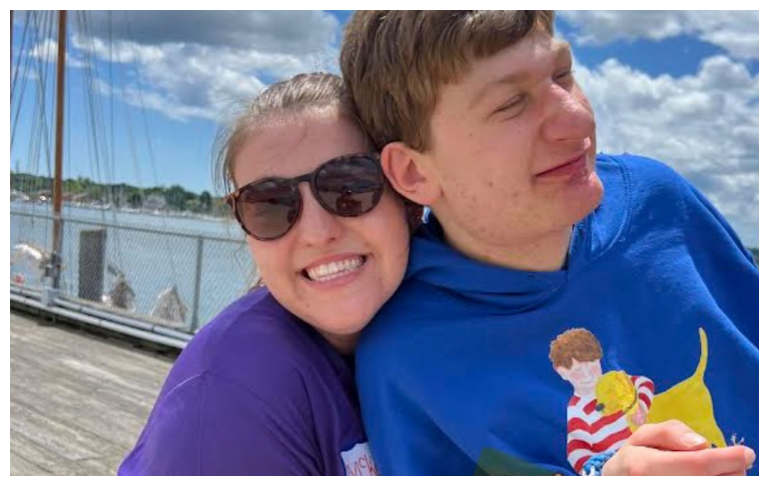
Thank you for sailing with us!