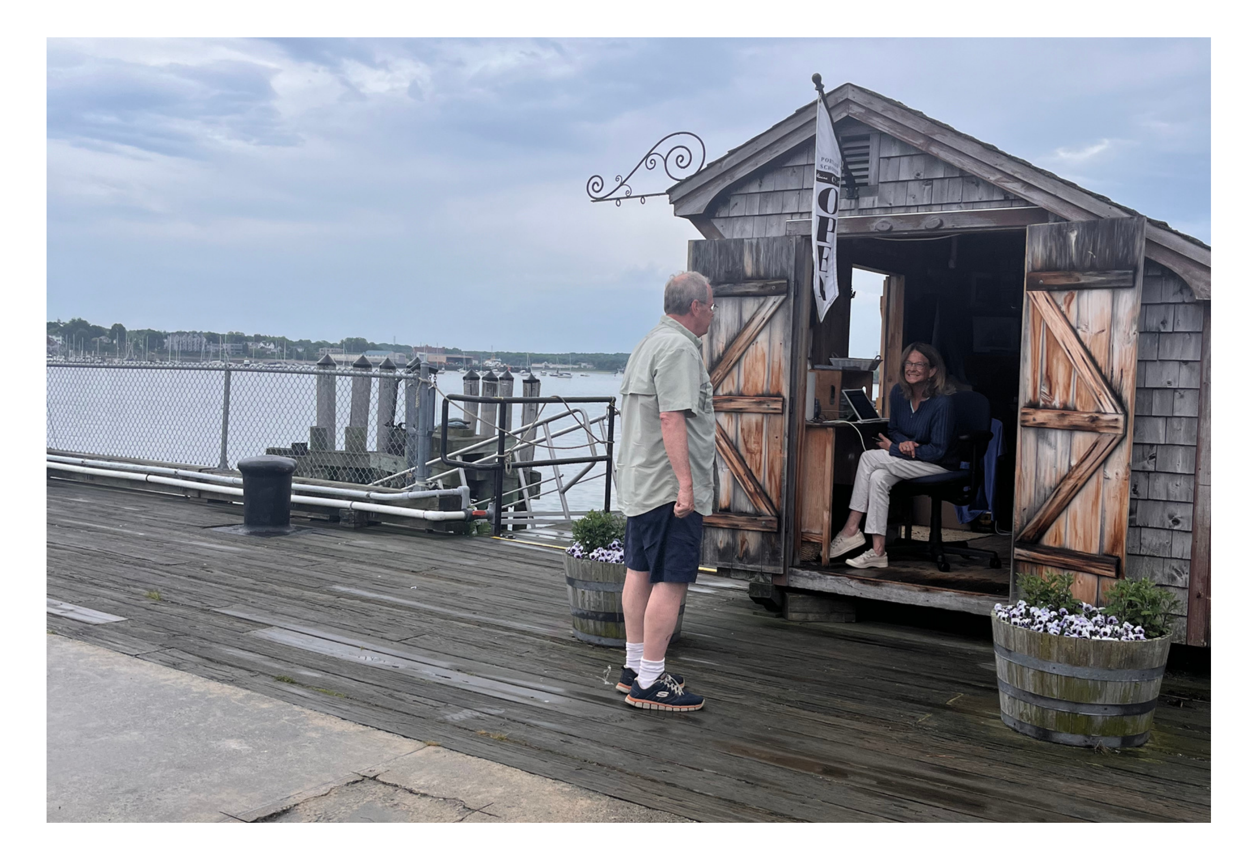
After walking down the dock, you will check in at the Portland Schooner Co. Office.